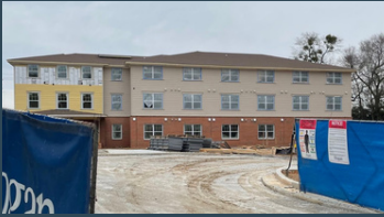
Covenant House Georgia