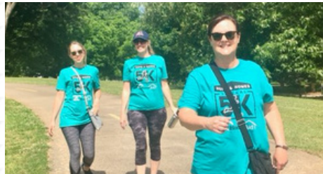
Hope & Homes Virtual 5K