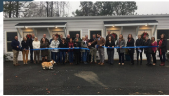
North GA Angel House Jasmine House