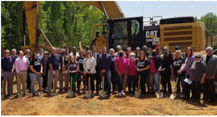
Gigi's House Groundbreaking