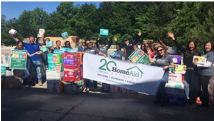
20th Annual Essentials Drive