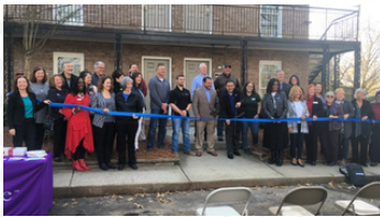
The Drake House