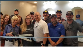
North GA Angel House Lotus House