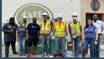
Communities of Hospitality