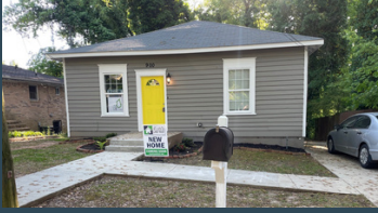
Atlanta Land Trust

In 2021, we completed seven major projects adding or preserving 81 beds. The total retail construction value was $813,749, and through in-kind donations of labor and materials, we saved our nonprofit partners $604,905.