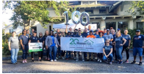
100th Care Day