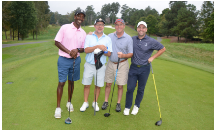
19th Annual Golf Tournament