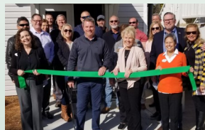
North Georgia Angel House