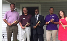
House of Dawn