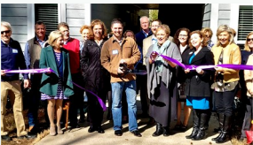
The Drake Village